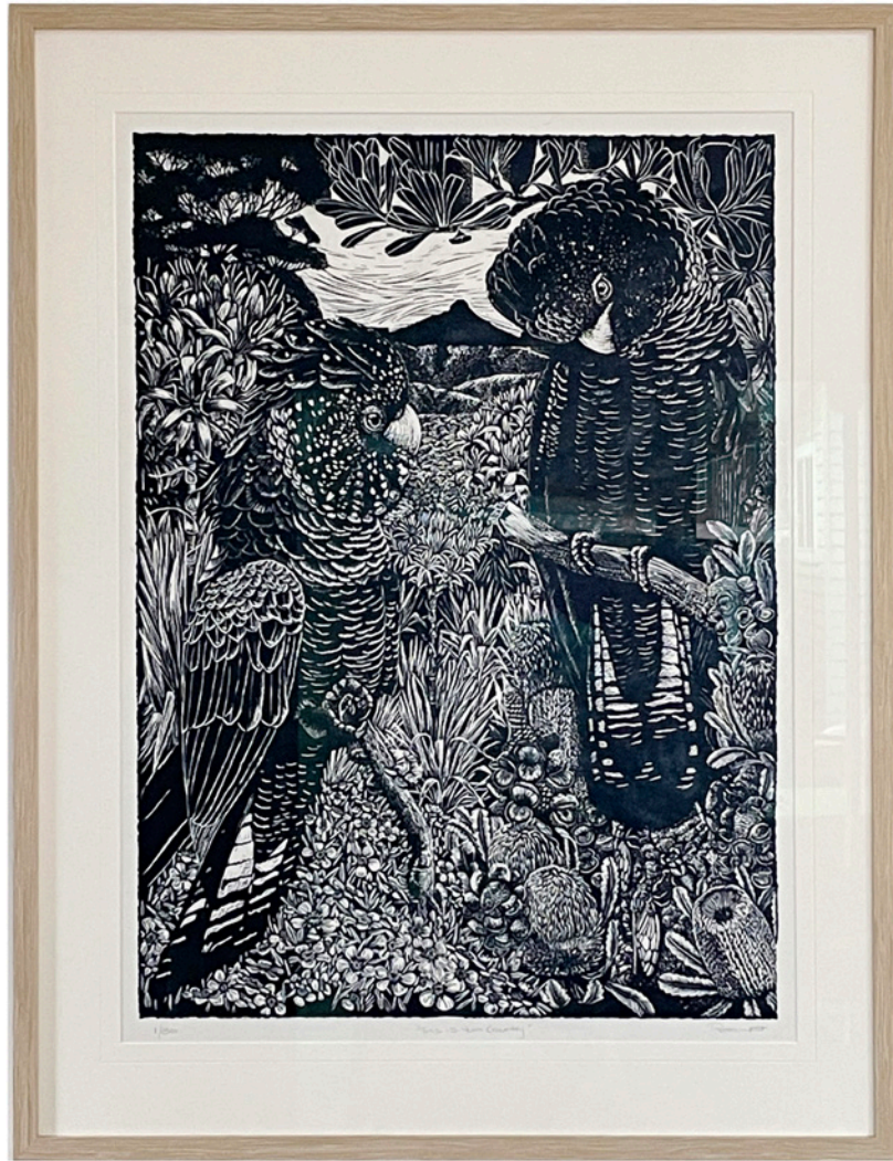
THIS IS YUIN COUNTRY

All prints in Collection II are framed in a Natural Oak frame