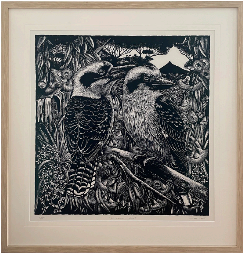
Clockwise from top, AT DAWN AND DUSK and FLANNEL FLOWERS AND GIN